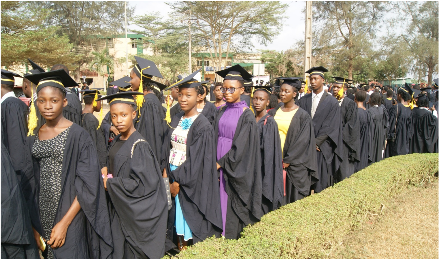
Some undergraduates during procession into the Multipurpose Hall for the 13 th Matriculation Ceremony of the University