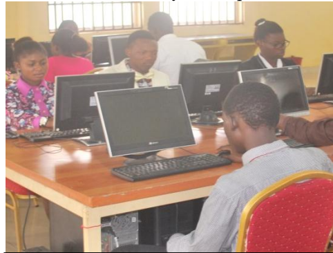
Students patiently set to start their CBT Exam