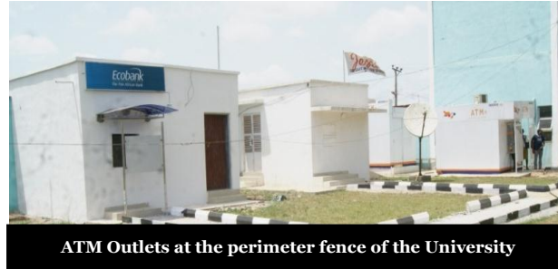
ATM Outlets at the perimeter fence of the University

The Ecobank Automated Teller Machine, ATM Gallery under construction at the perimeter fence of the University is nearing completion. Crawford Highlight's team investigation revealed that the gallery would open one outlet into the campus and three outlets outside the campus. This would bring the number of outlets from Ecobank to six while the total outlets would go up from four to eight in all. These outlets are between Ecobank and Access Bank, as the Zenith Branch Gallery is non-operational as work has stopped on its development since last year.