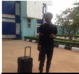
A student resuming after the short break

Crawford Highlight interviewed some of the returning students on, how they have enjoyed the short break.